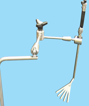
Shown with optional 10mm Fan Retractor NE08-0120A

Our B & H Surgical Martin's Arm is perfect for all hospital operating rooms with a minimum amount or limited staff. This retractor not only eliminates an additional hand from the sterile field, but also provides steady retraction for an unlimited amount of time. without fatigue.